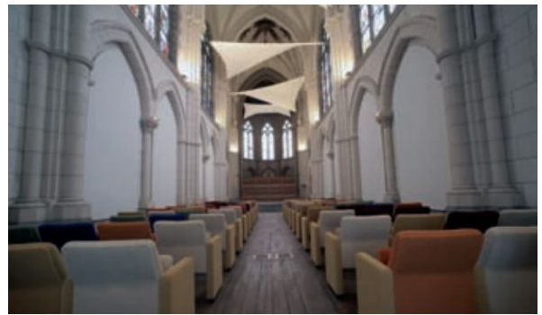
Fabric on Supporting Tensile Structure