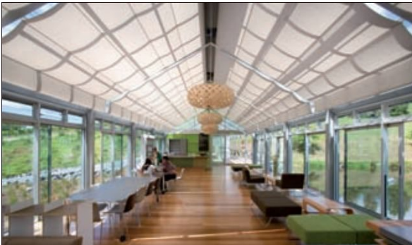
Frame-mounted Ceiling Partition