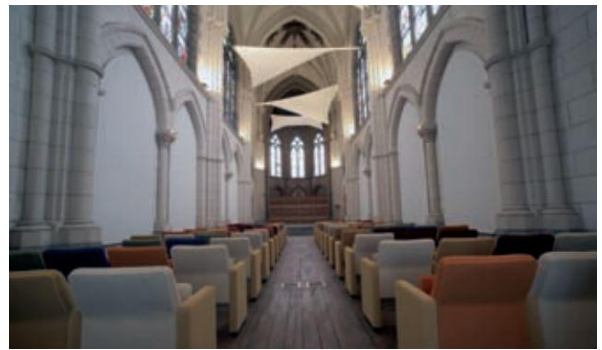
Fabric on Supporting Tensile Structure